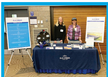
Red Cedar Watershed Conference