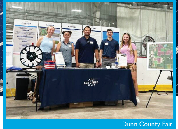
Dunn County Fair