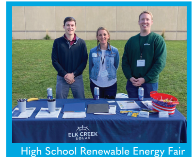
High School Renewable Energy Fair

What a packed year! We appreciate all the participation and feedback from the community that we have received throughout 2023. Without your involvement in the process, we wouldn't be where we are today – Approved for construction!